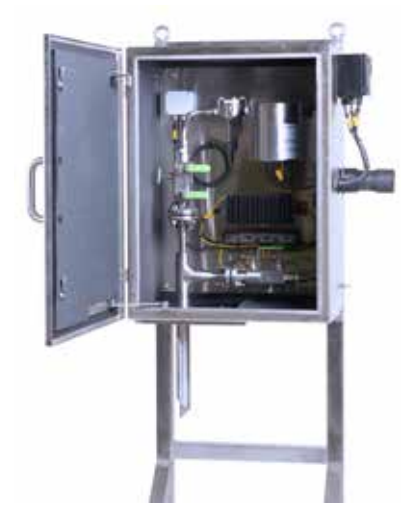
Figure 2: HIFISC Modular Sampling System

For customers using process gas chromatographs or any other analyzer, the installation of the HIFISC system has proven to be especially satisfactory. Another application for our system is in liquefied gas sampling, where we can provide a fast loop, returning the sample to the process with no need for a fast loop pump. For LPG-type samples, fast responding systems can be achieved with minimum system maintenance and low sample-to-flare flow rates.