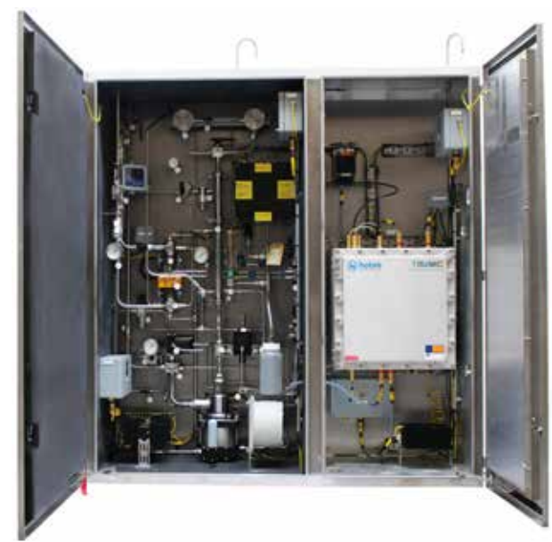
Figure 5 - H_2S in liquid analyzer system

Typical repeatability on a Natural Gas application, having 0-10~\rm ppm~H_2S is 0,25 ppm. The above graph shows a stability trend on a 5,6 ppm hydrocarbon stream over 20 hours.