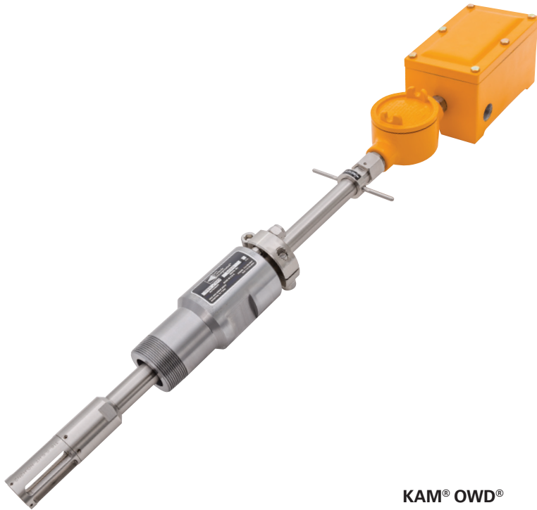
KAM ® OWD ® WATERCUT METER

Using multiple microwave frequencies, the patented multi-antenna design of the KAM ® OWD ® ensures consistent accuracy across the entire 0-100% range.