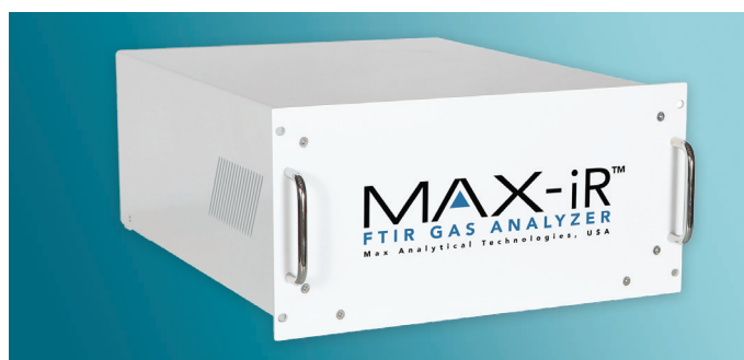
MAX-iR FTIR gas analyzer.

A deuterated triglycine sulfate (DTGS) detector comes standard with the MAX-iR analyzer. With the optional StarBoost technology, users can choose between indium arsenide (InAs) or mercury-cadmium-telluride (MCT) detectors. All systems come standard with Thermo Scientific™ MAX-Acquisition™ Automation Software and MAX-Analytics™ Software that provide industry-leading analytics, factory integration tools, high speed identification of compounds, and measurement accuracy/stability without the need for calibration.