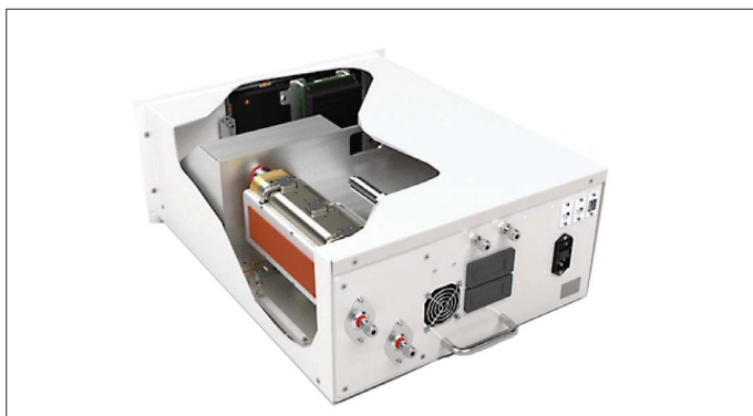
The back and inside of the MAX-iR FTIR gas analyzer.